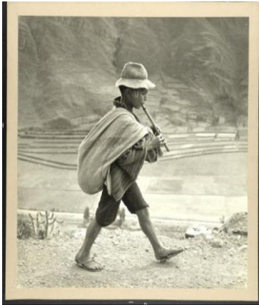
On the road to Cuzco, Peru, 1954