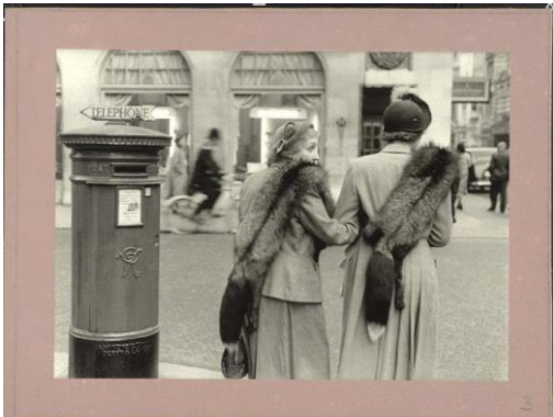
Bond Street, London, England, 1953